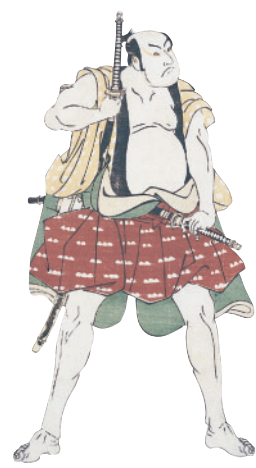
A samurai warrior ▼

Following his own motto “Rule the empire by force,” Nobunaga sought to eliminate his remaining enemies. These included rival daimyo as well as wealthy Buddhist monasteries aligned with them. In 1575, Nobunaga’s 3,000 soldiers armed with muskets crushed an enemy force of samurai cavalry. This was the first time firearms had been used effectively in battle in Japan. However,