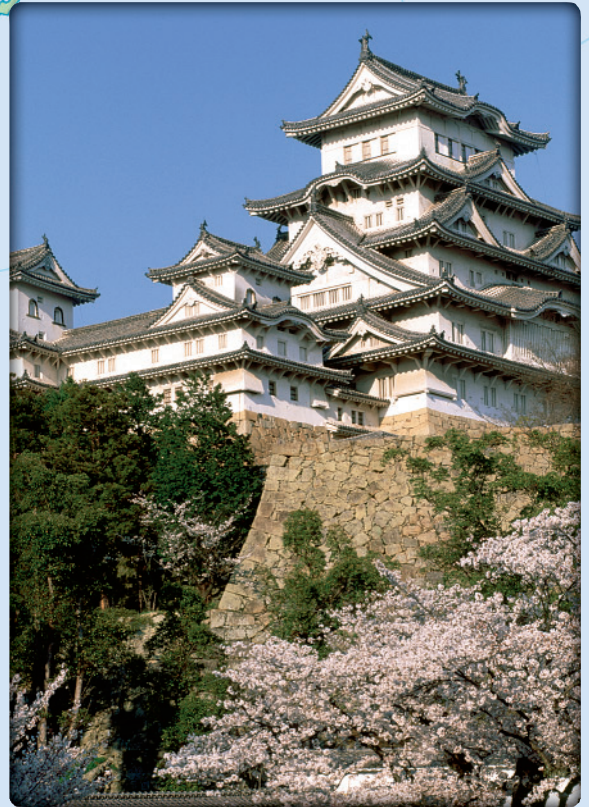
▲ Himeji Castle, completed in the 17th century, is near Kyoto.