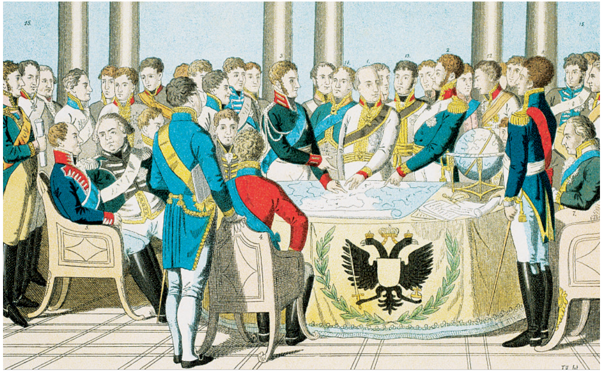
▲ Delegates at the Congress of Vienna study a map of Europe.

These changes enabled the countries of Europe to contain France and prevent it from overpowering weaker nations. (See the map on page 674.)