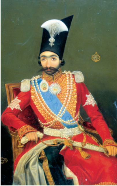
▲ Nasir al-Din was killed by one of al-Afghani's followers a few years after the boycott.

Battle over Tobacco Tension arose between the often corrupt rulers, who wanted to sell concessions to Europeans, and the people. The people were often backed by religious leaders who feared change or disliked Western influence in their nation. In 1890, Persian ruler Nasir al-Din sold a concession to a British company to export Persian tobacco. This action outraged Jamal al-Din al-Afghani, a leader who supported the modernization of Persia. He helped set up a tobacco boycott by the heavy-smoking Persians. In the following quote, he expresses his contempt for the Persian ruler: