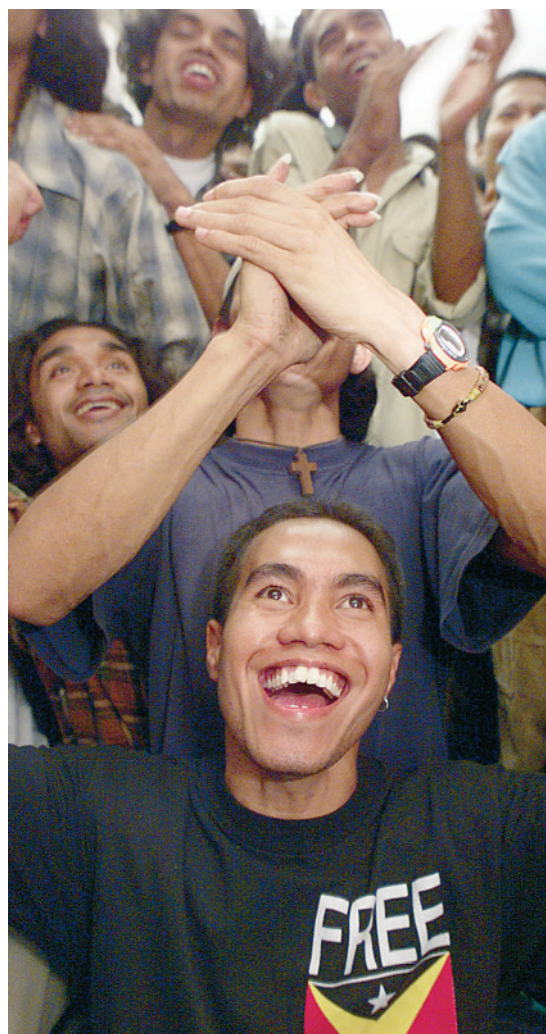
▲ East Timorese celebrate their overwhelming vote for independence in 1999.

As on the Indian subcontinent, violence and struggle were part of the transition in Southeast Asia from colonies to free nations. The same would be true in Africa, where numerous former colonies shed European rule and created independent countries in the wake of World War II.