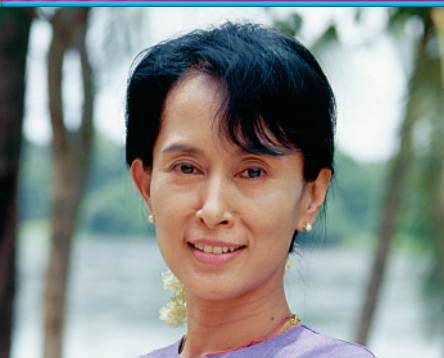
Aung San Suu Kyi 1945–

Aung San Suu Kyi won the Nobel Peace Prize in 1991 for her efforts to establish democracy in Myanmar. She could not accept the award in person, however, because she was still under house arrest.