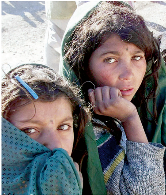
▲ Two Afghan girls quietly wait for food at a refugee camp on the Afghanistan-Iran border.